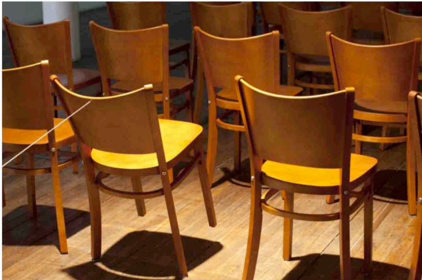
CINEMA, COURTESY SWISS INSTITUTE NEW YORK. PHOTO BY DANNY PEREZ

A second room within the exhibition shows a work that uses the artist's simple, workaday magic to produce a rumination on music. Two large fans blow ping pong balls slowly and chaotically around the strings of an open piano, producing eerie, inconsistent tones. In the last two rooms, four screens showcase Signer's films and video. Office Chair , 2010, exemplifies the artist's ease at effecting visual seduction with an economy of devices: an office chair spins wildly—yet statically—in the flow of a wooded creek. The HD video is a departure from the artist's beloved Super 8. "I want to get back to Super 8, not for questions of nostalgia, but because I think it's a very interesting medium, much more filmic to a certain extent," says Signer. The exhibition also calls into the question the difference between a Signer work created for a film, and the installations he creates specifically for galleries. Parsing this difference, Signer explains: "Film asks for narratives, and you have to think in narrative terms. The installations are more like organisms, that just have a life in themselves. Also, you can enter and exit an installation. Film has fluidity; it's more spontaneous. Before I used film, I would [use still photographs to document] a sequence of different movements."