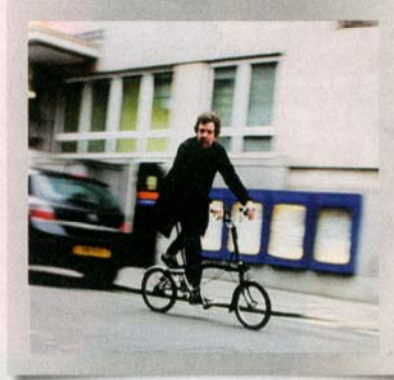
This is me on my bike. I like this type of folding bike because it means that you can get a taxi home.