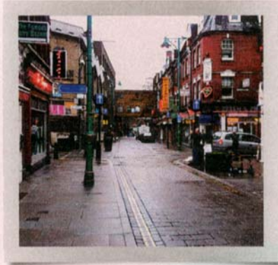
This is the street outside my studio. My doorway is on the left. People are always vomiting in that doorway.