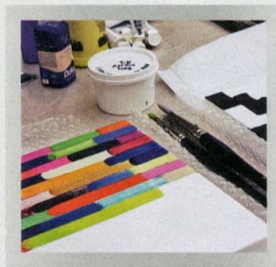
This work has been in progress for months – a different colour's added each day, but I'm trying to finish it now, for the opening of my exhibition.

Martin Creed's Mothers Is showing at Hauser & Wirth, London ( hauserwirth.com )