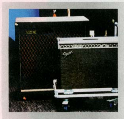
I wish I had a smaller amp.