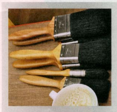
A multipack of brushes. I like multipacks because they have all the different sizes in them and it means you don't have to choose.